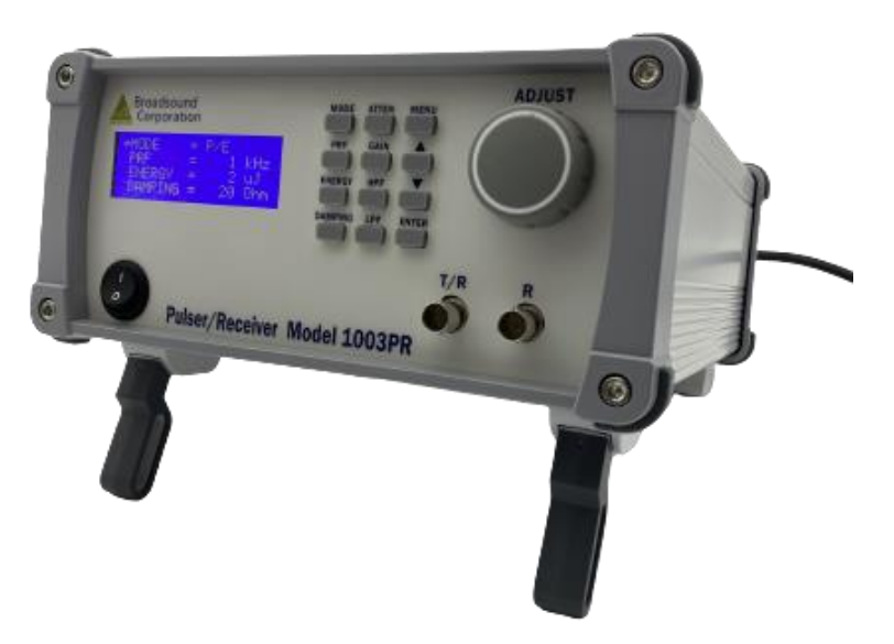
Figure 1. Appearance of the Pulser/Receiver 1003PR.

- Appearance and Overall View of Pulser/Receiver 1003PR